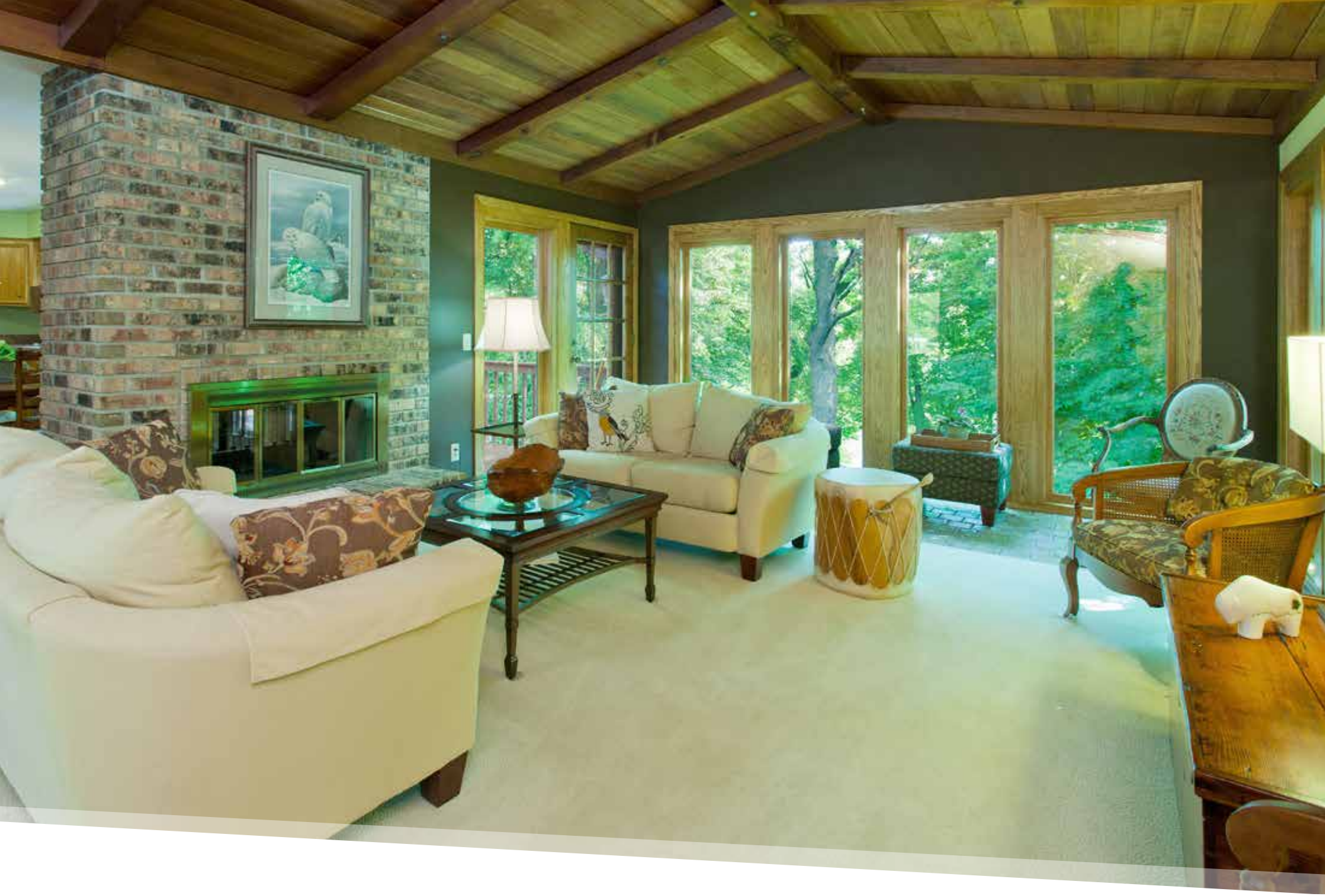
660 BROCKTON LANE NORTH HADLEY LAKE ■ PLYMOUTH